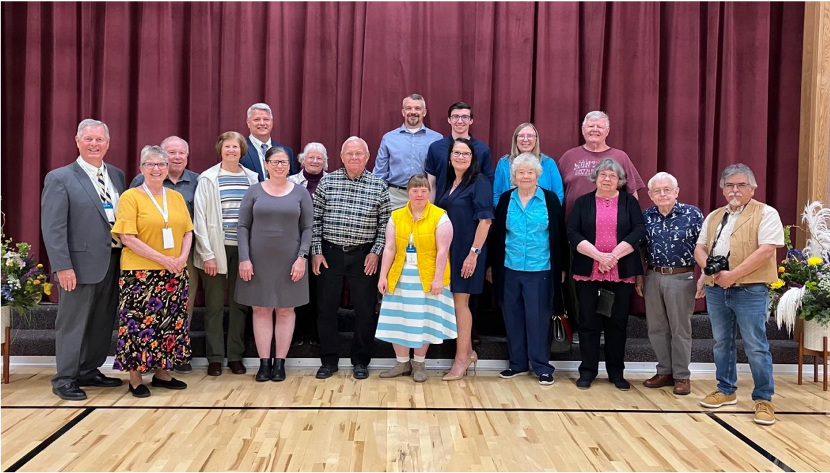
The group that toured the Temple