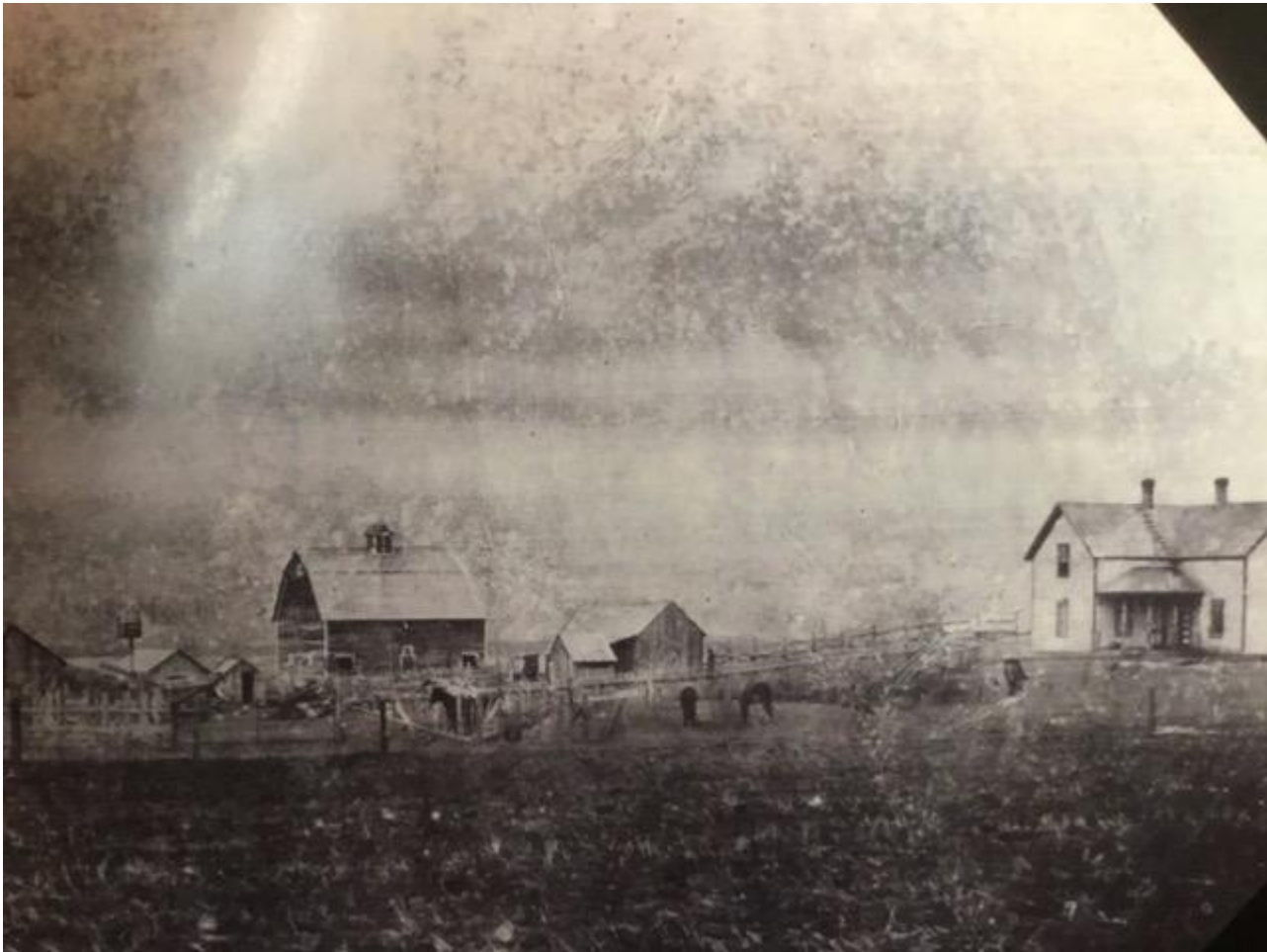
Original house and garage on Spring Creek Road.

In this picture the garage closest to the house had a front door and a back door.