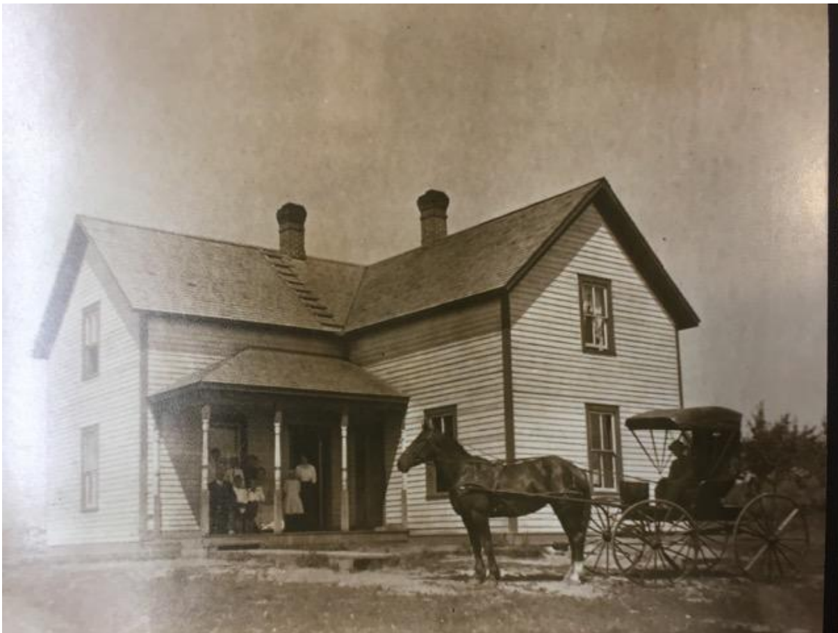
House and buggy.